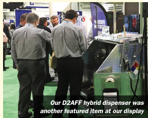
Our D2AFF hybrid dispenser was another featured item at our display