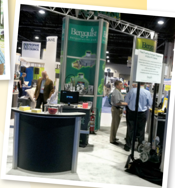
NPGA Southeastern Convention & International Propane Expo