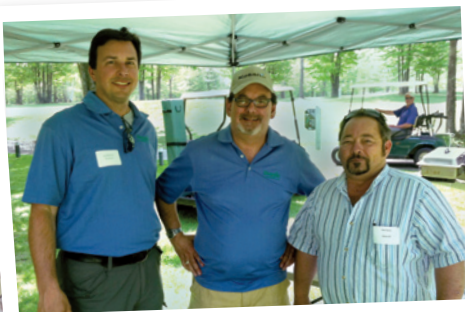
ABS Fun Day