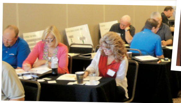
PERC's DRIVE Sales with Autogas workshop