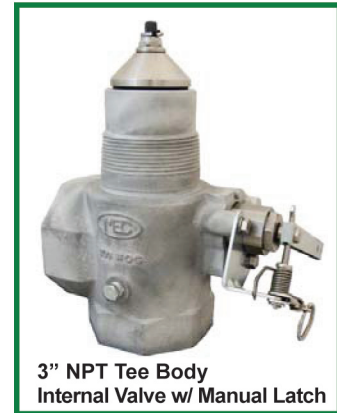
3" NPT Tee Body Internal Valve w/ Manual Latch