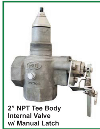
2" NPT Tee Body Internal Valve w/ Manual Latch