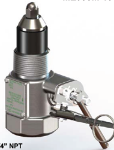
1-1/4" NPT Internal Valve w/ Manual Latch