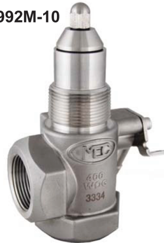
1-1/4" NPT Tee Body Internal Valve w/ Manual Latch