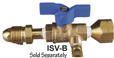
ISV-B Sold Separately